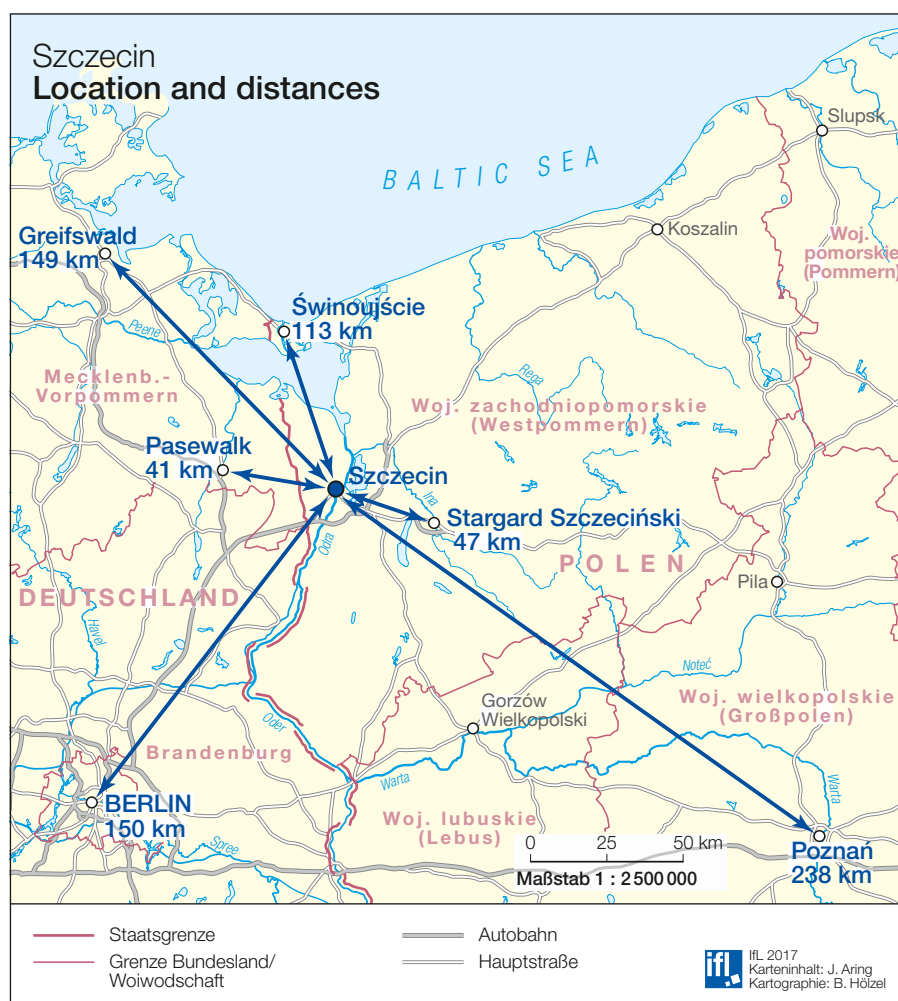
Map 1: Szczecin: location and distances

As the region is large in size, the distances within the region are quite long as well. It is about 113 km from Szczecin to the port city of Świnoujście, about 149 km to